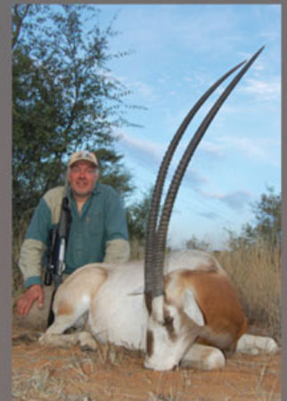
Schimtar Horned Oryx