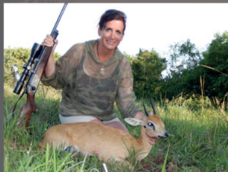
Oribi - Uganda